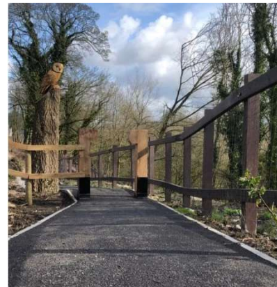
Primrose Lodge, Clitheroe.

3.12 Key Statement EN3 of the Adopted Core Strategy sets out that new development should ensure that risks can be managed through suitable measures, including through the conservation of biodiversity, improvement of ecological networks and the provision of green infrastructure. The Council's commitment to conserving and enhancing the area's biodiversity and geodiversity is reiterated on Key Statement EN4. Where appropriate off-site commuted sums will be secured to enhance biodiversity within the Borough.