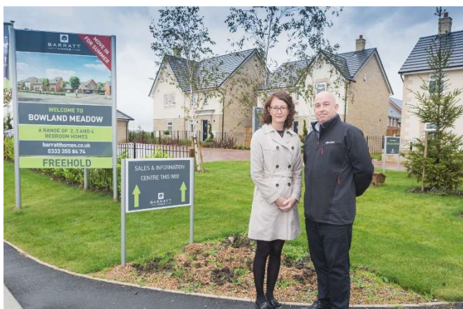
Affordable properties have been secured as part of development at Bowland Meadow, Longridge.