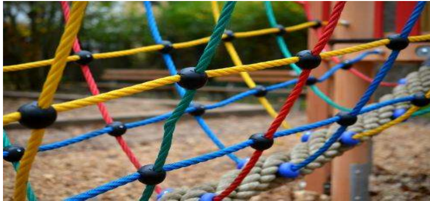
Holme Play Area, Sabden – Supported by S106 contributions.

3.10 The off-site contribution will be used to improve existing facilities within the Borough or to support the provision of new facilities for the benefits of our residents and visitors.