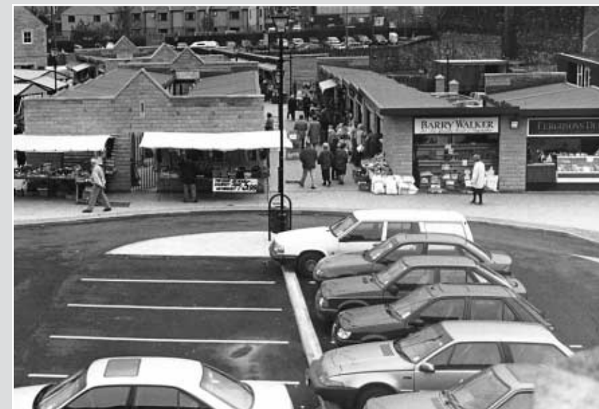
●The new Clitheroe Market