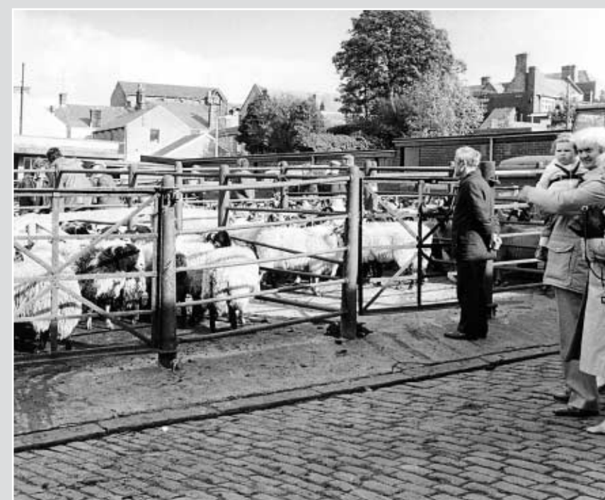
●The old Clitheroe Cattle Market

"Our sound financial position is down to strong financial discipline, prudent management and a committed and dedicated workforce, and I would like to pay tribute to staff and councillors, past and present, for delivering efficient, cost-effective and first-class services over the last 40 years."