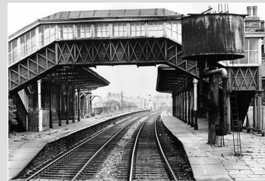
●The semi-derelict Clitheroe Rail Station