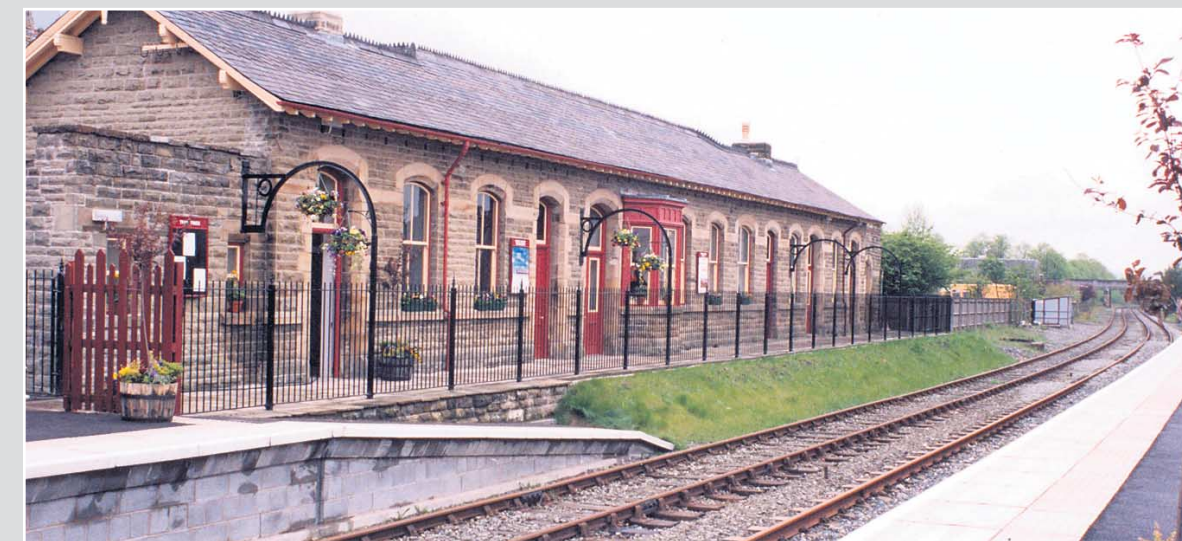
●The new-look Clitheroe Interchange and Platform Gallery