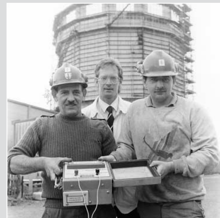
●The Clitheroe Gasworks demolition