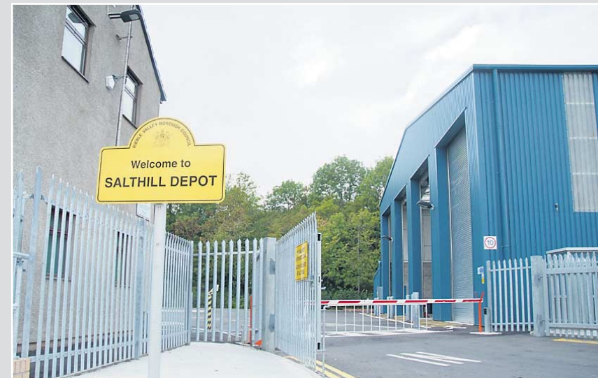
●The council's Salthill Depot and flagship waste transfer station