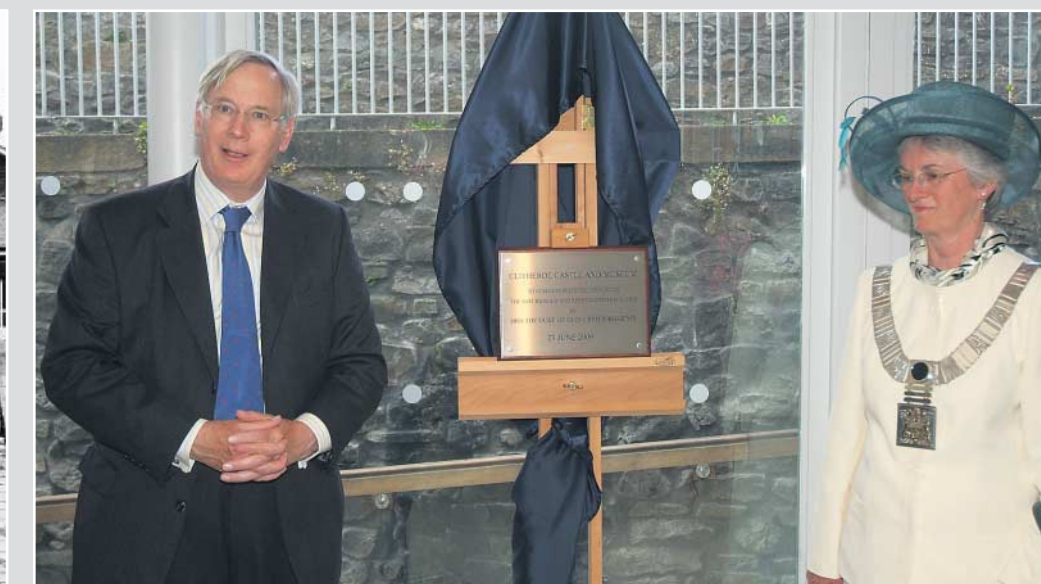
●A Royal opening for the £3.5million Clitheroe Castle Museum