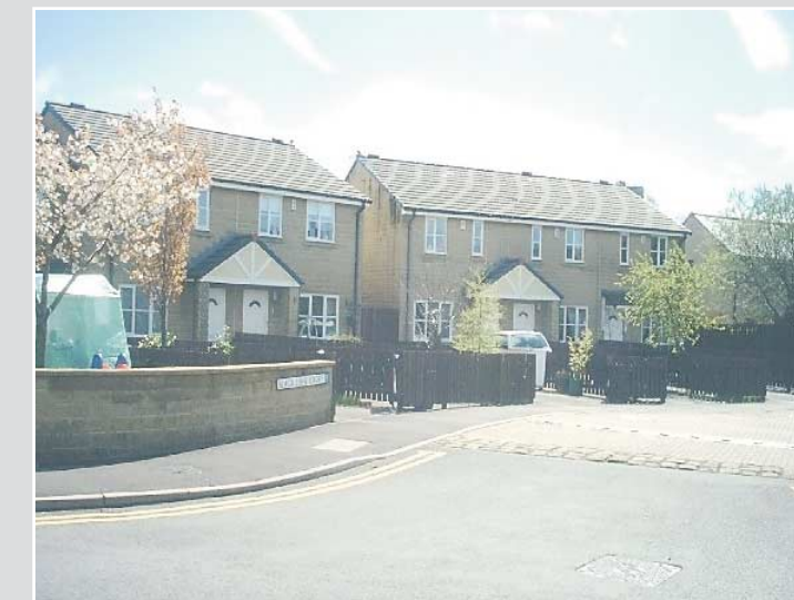
●Much-needed affordable housing at Black Lane Croft