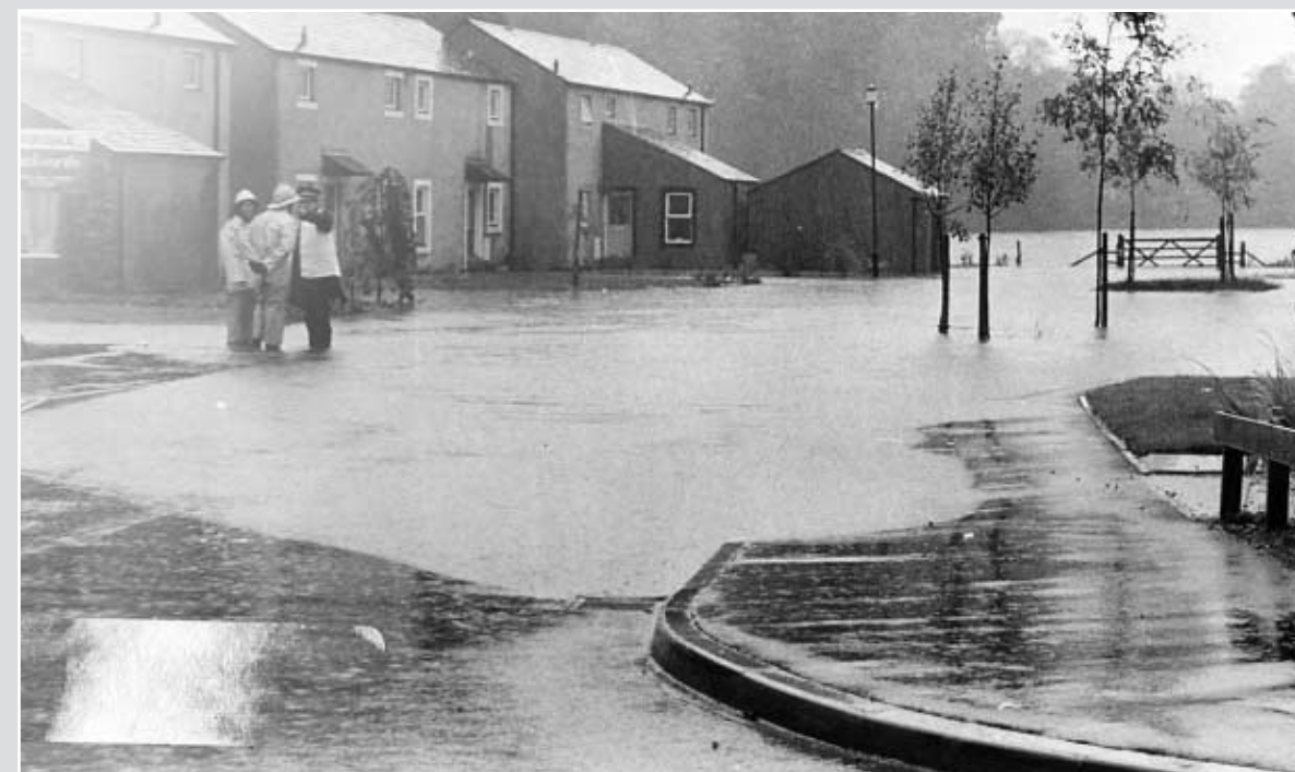
●Flooding at Riverside Estate, Low Moor