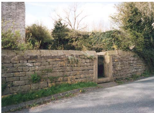
Typical stone wall with triangular stone coping

Worston is a small, secluded rural hamlet located between Clitheroe and Pendle Hill along the banks of the winding Worston Brook. The A59 lies immediately to the west, with rolling fields filled with sheep to the east and south. The road through the village carries only local traffic to a few houses and farmsteads at the foot of Pendle Hill, and is a 'quiet lane' leading to Downham.