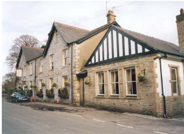
The Calf's Head Hotel