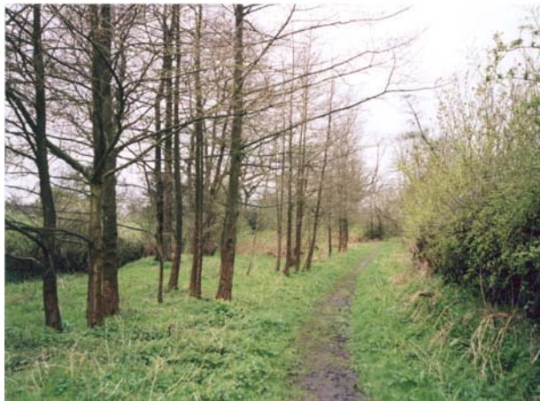
Footpath beside Worston Brook

The proposed Worston Conservation Area boundary is marked on the accompanying map. The boundary has been drawn to enclose the whole of the settlement of Worston together with surrounding farmland that is essential to its rural setting.