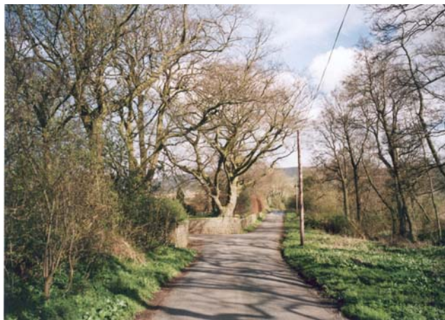
The lane leading east out of the village

Crow Hill Cottage (grade II) possibly dates from the 17 th century. Though altered, it retains a roof of sandstone slabs, an increasingly rare characteristic of the locality. A 16 th century moulded fireplace, possibly re-used, is mentioned in the list description.