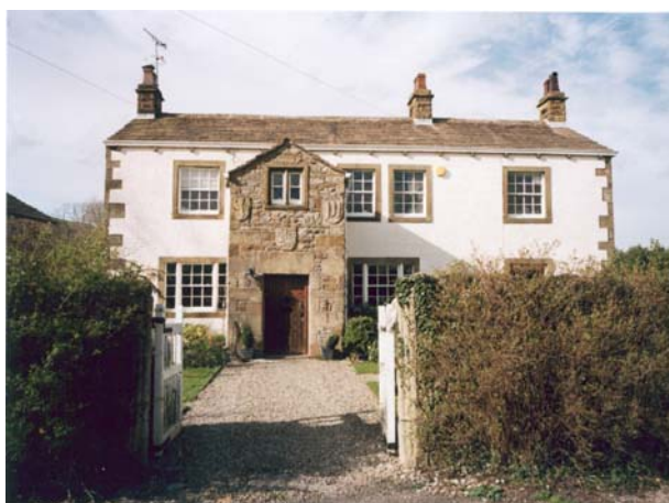
Worston Old Hall (grade II)

The conservation area encloses about 30 properties which make up the small hamlet of Worston. The majority are located alongside the main street between Club Farm and Crow Hill Cottage, generally set close to the road with gardens behind. There are gaps between buildings enabling views of Pendle Hill.