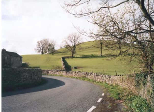
Crow Hill from the road bridge

A Roman road cuts across the land between Worston and Clitheroe but the earliest reference is to Wrtheston in 1241 when much of the land was owned by John de Lacy of Clitheroe. The adjoining manor of Mearley was granted by his ancestor, Robert de Lacy, to Ralph le Rous in 1102 and further land was owned by the Abbeys of Whalley and Sawley. In 1311 Henry De Lacy was still the major landowner. The settlement appears to have developed as a small agricultural hamlet, with a number of buildings lying along the main street. There was never a church, although a mission room was provided which had associations with Christ Church in Chatburn.