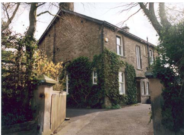
Hall Croft, a 19 th century dwelling

The conservation area is characterised by mainly 19 th century vernacular building with a very few buildings dating from the 17 th or 18 th century (or containing 18 th century fabric), and a similar number from the early 20 th century. Stone is the prevalent building material, mainly locally quarried limestone. Coursed or uncoursed, it is generally exposed but late 19 th century buildings, and others, are sometimes covered in smooth or roughcast render. Most buildings are roofed with slate; a few have traditional stone slate roofs.