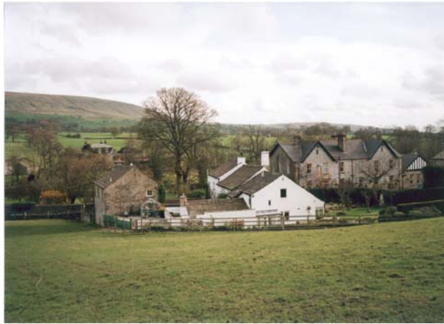
View south over Worston from the side of Crow Hill

The area's buildings and spaces are noted and described, and marked on the Townscape Appraisal map along with listed buildings, buildings of townscape merit, significant trees and spaces, and important views into and out of the conservation area. There is a presumption that all of these features should be "preserved or enhanced", as required by the legislation. A number of issues are identified and recommendations made.