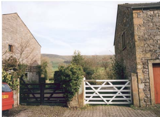
View between buildings to moorland on higher ground