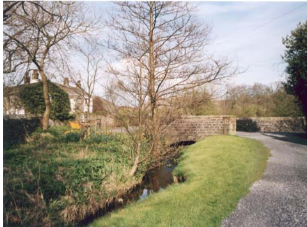
The bridge to Worston House