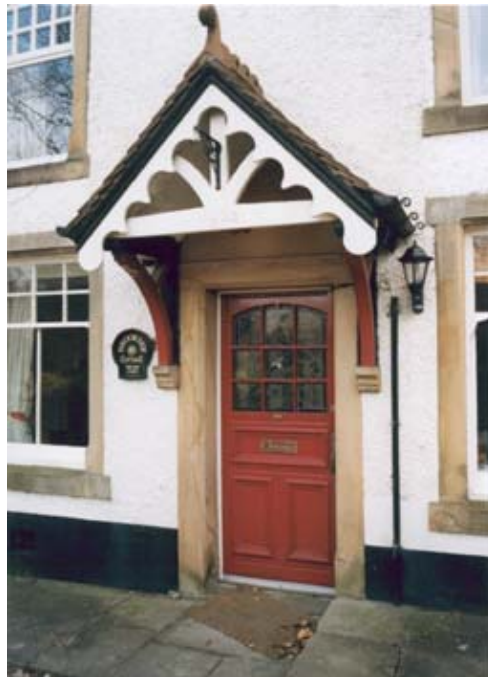
Brookside Cottage (1903)

Window and door openings are often surrounded with single slabs of sandstone, a typical Ribble Valley detail. This characteristic detail has been continued in some of the barn conversions but stained timber windows and large panes of glass are out of character with the hamlet's historic appearance. Joinery is typically white painted softwood.