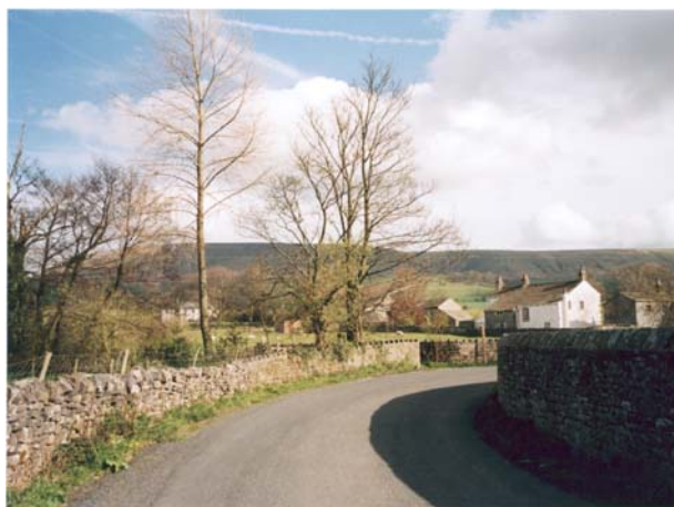
Looking eastwards towards Pendle Hill

This document should be read in conjunction with national planning policy guidance, particularly Planning Policy Guidance Note 15 (PPG 15) – Planning and the Historic Environment. The layout and content follows guidance produced by English Heritage, the Heritage Lottery Fund and the English Historic Towns Forum.