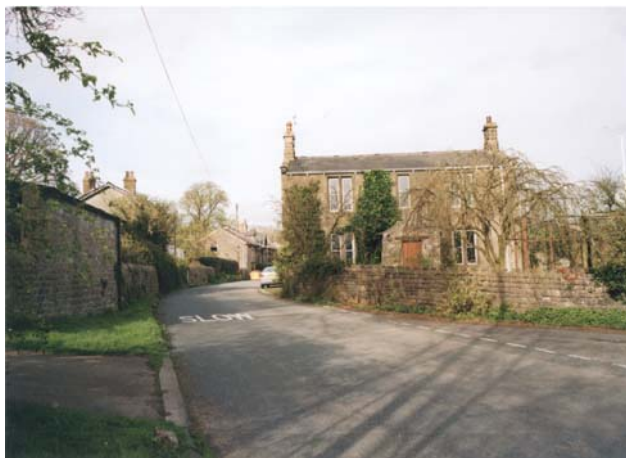
The entrance to the village from the A59