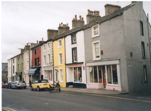
Nos 2-18 York Street, a mid 19 th century terrace

In brief, the Clitheroe Conservation Area contains the commercial, administrative and business heart of a Lancashire market town with a population of 14,000. Clitheroe's castle, specialist shops and historic ambience make it a popular tourist destination. The town as a whole has below national average unemployment and generally the town is regarded as being relatively prosperous.