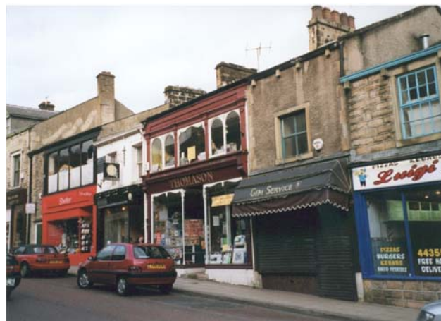
Two-storey shopfront in Moor Lane

This area contains the commercial core of the town, mainly located on Castle Street and Market Place but also spilling onto Wellgate, York Street and King Lane. The central 'spine' of the conservation area contains an excellent collection of historic buildings built on a strong back-of-pavement line but with occasional buildings breaking forward with a gable. There is a fall in the street from the Castle entrance to the open space of Market Place from where the land rises up Church Street but down York Street and Wellgate. Looking south there are views of the Castle and to the east, from outside The White Lion, distant views of Pendle Hill.