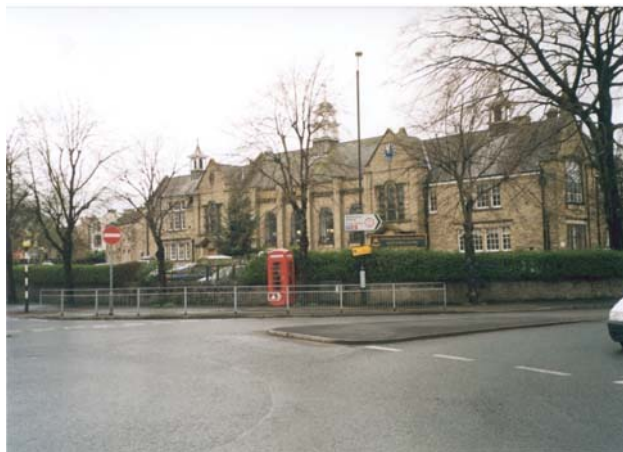
Clitheroe Royal Grammar School a key building at northern approach to the town

The Public Library of 1905, with its conical roof and clock face, has been well designed to take advantage of its corner location and is a notable landmark overlooking the historic Market Place which is still the focus of the town centre. The town's banks are also located on corner sites, giving them prominence in the streetscene.