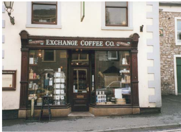
Traditional shopfront, 24 Wellgate

The construction of the first textile mills and the opening of new turnpike roads led to the first major expansion of the town and the construction of new streets, Moor Lane, York Street and King Street. By 1851 the population had risen to 7,000 and there were nine textile mills working in Clitheroe. Housing for the mill workers was located away the town centre beside the new mills.