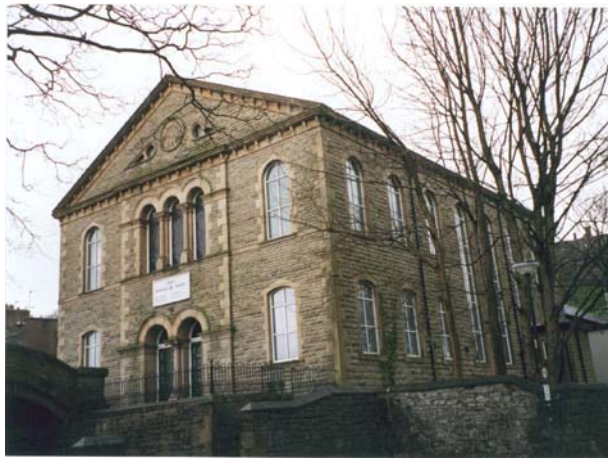
Methodist Church (1868)