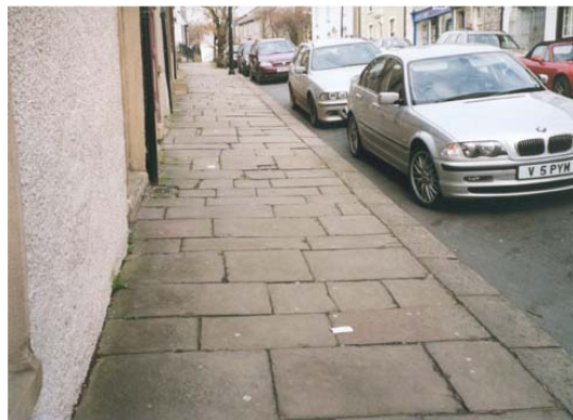
Stone paving, steps and iron boot scraper in Church Street

In Clitheroe, as in other market towns, the 18 th century marked a movement away from traditional vernacular building to a more consciously designed 'polite' form of architecture. Buildings from this period are influenced by a sense of proportion and incorporate sliding sash windows and elements of classical detailing such as pediments and friezes. In the 18 th century Church Street was the main route into and out of the town and No. 21 Church Street is a good example of Clitheroe's Georgian architecture.