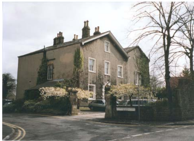
Stanley House, Lowergate

The Clitheroe Conservation Area contains a high proportion of commercial premises and a special feature of the conservation area is the remaining number of complete and partial 19 th century shopfronts. Good examples of reasonably complete historic shopfronts are 11 Castle Street, 31 Castle Street and 24 Wellgate. In Moor Lane there are examples of two-storey shopfronts; no.17 Moor Lane is a particularly good example, listed grade II. Many modern shopfronts incorporate elements of earlier traditional shopfronts such as timber fascia or scrolled consoles. These should be preserved.