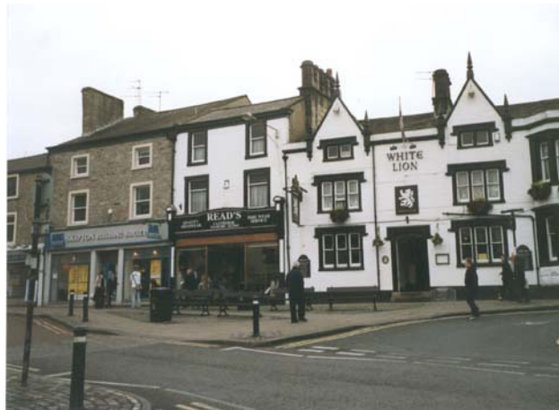
White Lion, Market Place

A particular architectural feature of interest is the different ways in which rainwater gutters are supported with curled metal or carved stone brackets at eaves level. Variety in design can best be appreciated in Church Street. Nos. 12-16 York Street have a moulded stone eaves cornice behind which the gutter is concealed.