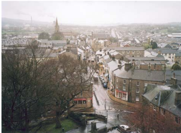
View along Castle Street from Clitheroe Castle

This appraisal builds upon national policy, as set out in PPG15, and local policy, as set out in the Local Plan 1998, and provides a firm basis on which applications for development within the Chipping Conservation Area can be assessed.