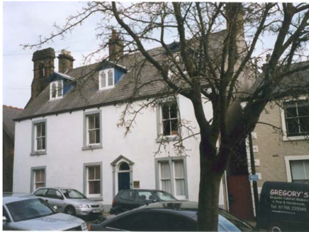
No. 12 Church Street

The castle was not only a defensive building. It contained within its outer enclosure the chapel of St Michael in Castro although by 1717 nothing but the walls of the chapel remained. It was also an administrative centre and was the main court of the Blackburn Hundred, with a court house, gaol, stables and other important buildings to enable the de Lacy family to control their land from one regional centre. It was not until the construction of a town hall in Church Street in 1820 that local government finally shifted from the Castle to the town.