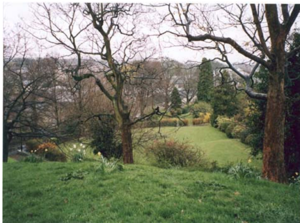
Castle Grounds in early springtime

Other features of interest include the red telephone kiosk in Well Terrace, boot scrapers in Church Street, cast iron rainwater goods and iron street name signs such as 'Waddington Road' attached to no. 1 Waddington Road. These and many other small items of local interest make a significant contribution to the overall historic character and appearance of the conservation area.