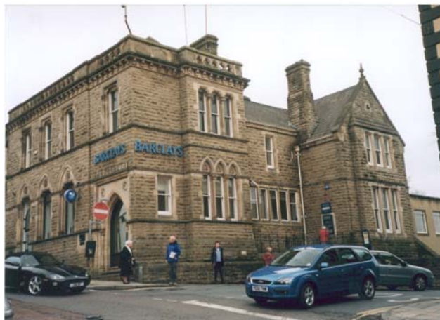
Bank building prominently sited at the junction of Castle Street and King Street

The opening of the new Whalley Road in 1809 brought about the construction of a new southern approach to the town centre, today's Moor Lane, which necessitated the demolition of buildings in burgage plots at the base of the Castle gates. Similarly the Chatburn turnpike, to the north of the town, stimulated the construction of a new northern approach road, York Road (c1820), leading directly to the Market Place, cutting through burgage plots on Wellgate.