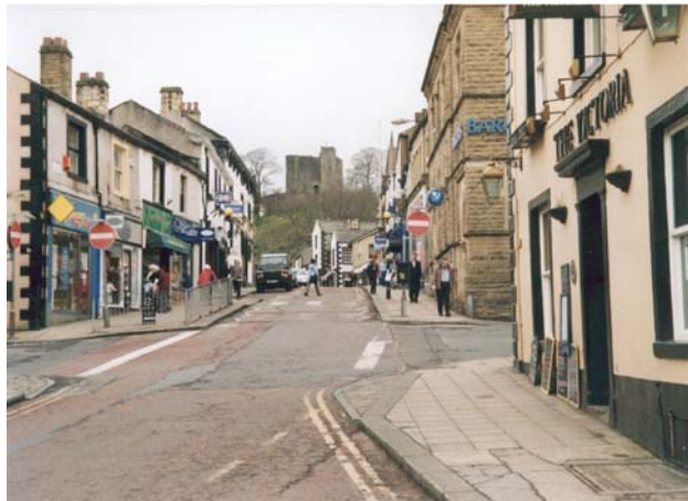
Junction of Castle Street and King Street

The Clitheroe Conservation Area contains the historic core of the medieval town including its principal medieval streets: Castle Street, Market Place, Church Street, Wellgate, Lowergate and Duck Street. In addition, the conservation area's boundaries have been drawn to include the whole of the Castle Grounds, the 19 th century streets of Moor Lane, York Street and King Street together with areas of 19 th century terraced houses along Eshton Terrace, Parsons Lane (Wesleyan Terrace), Brennand Street and St. Mary's Street.