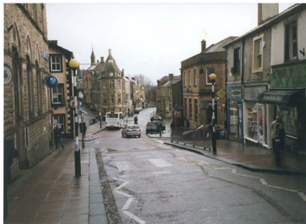
The Carnegie Library (1905) closes the view north along Castle Street

Many buildings are covered in stucco, a form of render that was popular in the early 19 th century. Similarly a large number of buildings have either by design or at a later date been rendered with a smooth or roughcast coat of plaster which conceals the walling material.