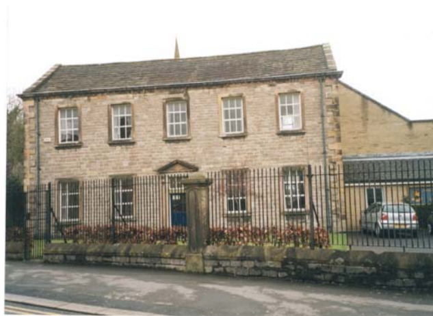
Clitheroe Royal Grammar School (1782), York Street

In addition to the above green areas, there are a number of other important open spaces which make a valuable contribution to the area's character and appearance. The foremost is the Market Place which, after 800 years is still the principal public open space in the centre of the town, enhanced with benches and other street furniture. Other important spaces are the car parks at Clitheroe Royal School, the Council Offices, and Lowergate.