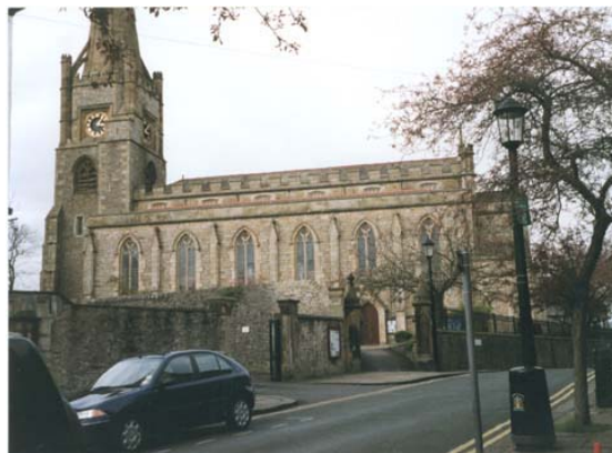
St Mary Magdalene's Church

This document should be read in conjunction with national planning policy guidance, particularly Planning Policy Guidance Note 15 (PPG 15) – Planning and the Historic Environment. The layout and content follows guidance produced by English Heritage, the Heritage Lottery Fund and the English Historic Towns Forum.