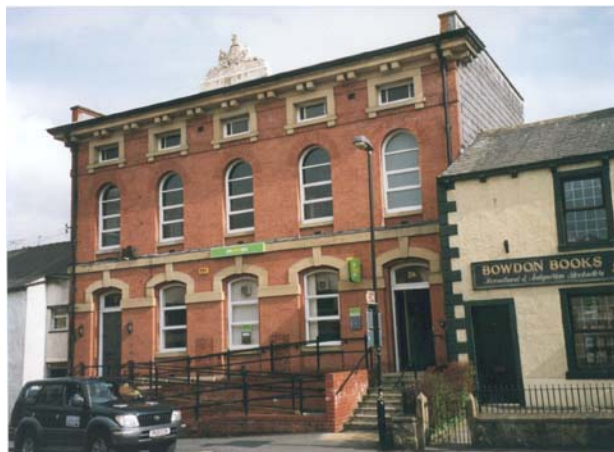
The former Court House is one of the few brick buildings in the conservation area

Stone setts are still present in Wilkin Square and setted stone kerbs and gutters can be seen in the 19 th century terraced streets north-west of St Mary Magdalene where the backstreets are also stone setted.