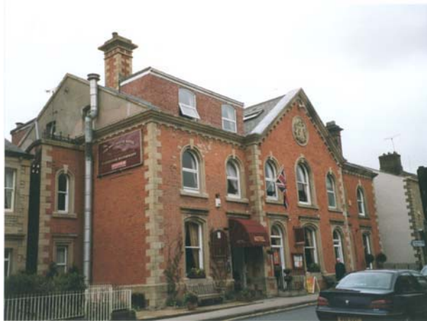
The Old Post Office Hotel, King Street

The northern end of this character area, and the conservation area, is dominated by the Clitheroe Royal Grammar School which is set back from the road behind a car park and a row of roadside trees and hedge. Though some buildings are modern, the early 20 th century core of the school building with tall bellcote and twin cupolas is an impressive gateway to the northern approach to the town.