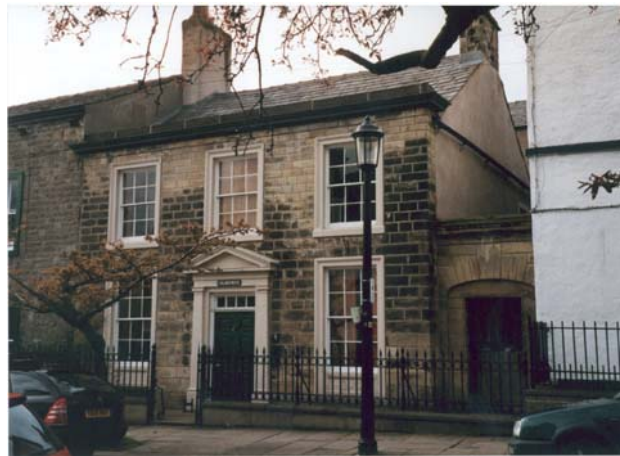
'Almonds', Church Street, a good example of Clitheroe's Georgian architecture

Along the town's central spine, buildings are built close to back-of-pavement line and occupy long and narrow plots though many original burgage boundaries have been obscured by sub-division, by 19 th century roads (e.g. Moor Lane and York Road) and by modern development. Frontages are composed of short rows, broken intermittently by arched entrances to the rear of properties, sometimes pedestrian width such as between nos. 31 and 33 Castle Street, sometimes the width of a carriage such as at nos. 1 and 4 Church Street or the Rose and Crown, Castle Street.