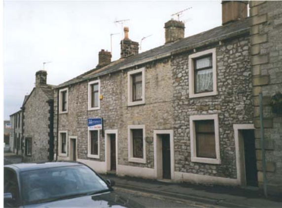
Nos. 6 – 12 Duck Street

St Mary's Street, Brennand Street and the south side of Waddington Road are typical late 19 th century terraces aligned in a grid pattern so that these streets rise up the incline towards St Mary Magdalene Church whilst Railway Terrace (dated 1892) runs roughly north-south, on the level. From the churchyard there is a view over the slate roofs enlivened by a regular parade of stone chimneys to the distant fells.