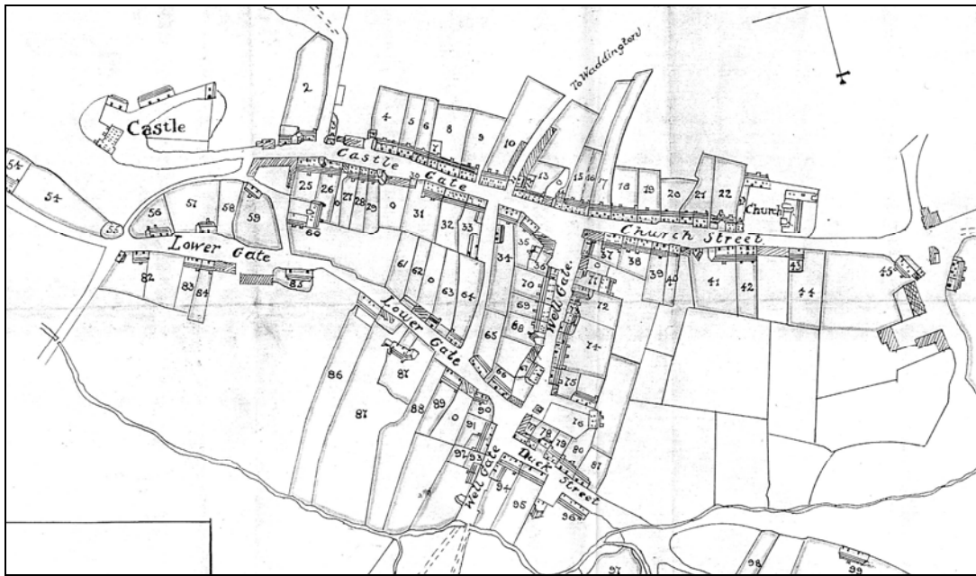
Lang's map of 1766