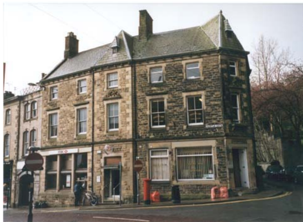
Nineteenth century bank building in Castle Gate

Wellgate descends from Market Place towards its junction with Lowergate where there is a spacious intersection. Development is both two- and three-storey presenting a disjointed eaves line to the street. The building line, on both sides of the road, is irregular: the gable end of no. 24 juts into the pavement, The Dog pub is set back behind the well. With the exception of nos. 2-6 Wellgate, the street contains a good collection of historic buildings of which nos. 29-33 are grade II listed. Shaw Bridge Street, the continuation of Wellgate, is narrower and there is a greater sense of enclosure which is lost at the wide modern road junction, where traffic noise level is high. On the north side, no 5 Shaw Bridge Street (a former chapel) is set back from the pavement behind an area of tarmac parking; further along the street, nos. 11-15 are also set back behind small enclosed front gardens.