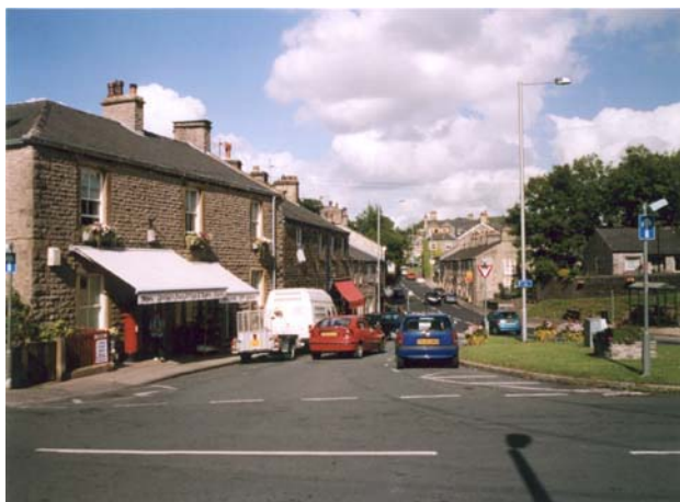
Chatburn's setting on slopes that descend to a bridge over the Chatburn Brook

The Chatburn Conservation Area comprises the whole of the historic village, and in the following text, the words 'village' and 'conservation area' are used interchangeably to mean the same thing. Almost all of the buildings within the conservation area were constructed before 1884. Those parts of the village not included within the conservation area consist almost exclusively of properties built since the 1930s.