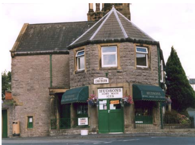
No. 2 Downham Road, the former toll house