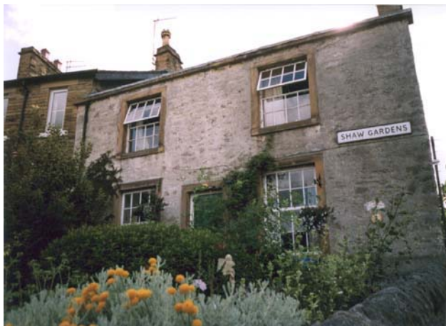
No. 1 Shaw Gardens, the former Rising Sun public house

This appraisal builds upon national policy, as set out in PPG15, and local policy, as set out in the Local Plan 1998, and provides a firm basis on which applications for development within the Whalley Conservation Area can be assessed.