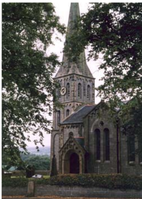
The neo-Romanesque Christ Church

The close proximity of two long moorland fells to the north west and south east of the village ensure attractive views out of the village. From the churchyard, the school and cricket pitch, the view takes in the village of Grindleton, then the conifer plantation on Grindleton Fell, and westwards to the radio mast on Waddington Fell. From the fields and lanes behind Downham Road and from Crow Trees Brow, the south-easterly view takes in the unmistakable shoulder and scarp of Pendle Hill.