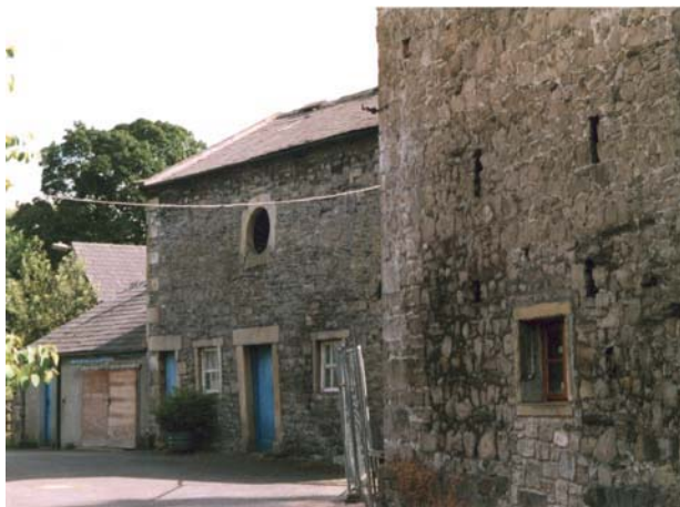
Grade-II listed Crow Trees Farm, Crow Trees Brow

One of the biggest changes was the construction of the Victoria Cotton Mill on a site north of Chatburn Bridge on the west bank of the Chatburn Brook (now demolished and replaced by the Victoria Court housing estate). It is likely that the building of the mill coincided with the development and infilling of the area immediately adjacent to the Chatburn Bridge. The east-facing terraces of Ribble Lane, Old Road, Shaw Gardens, Dale Terrace and Mount Pleasant might well have been built to house workers in the cotton mill.