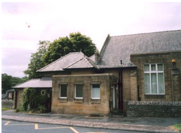
Downham Road school and library

A new school was built in the 1880s on a site to the south west of the church opposite the old toll house (built 1756 but substantially remodelled when tolls were abolished in 1879). Prior to this, a building on the edge of the village on the Downham Road was used as the school (it is not clear from the 1884 OS map whether the school was located in Swanside Cottage (which has a date stone of 1815) or in one of the buildings on the opposite side of the road. The school of the 1880s in the centre of the village has since been demolished, as part of a road-widening scheme of the 1950s. By then a new school had already been built in its current position, at the western end of the churchyard, and this has more recently been extended to provide a village library, institute and public conveniences.