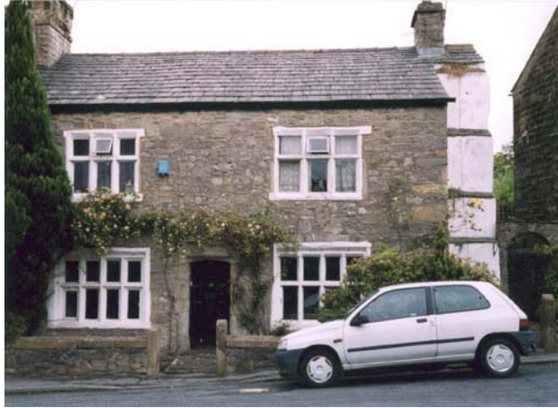
Grade-II listed No. 6 Downham Road

This durable limestone forms the basic building material for farm buildings, dwellings and boundary walls in Chatburn, occasionally mixed in with millstone grit from the uplands of Pendle Hill and Grindleton Fell. Nearby sandstone deposits from beds overlying the carboniferous limestone are used for architectural details, such as quoins, window and door surrounds, and for roof slates. Field gates and stiles are also made from sandstone.