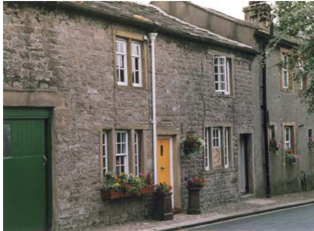
Nos 55 and 57 Downham Road have surviving stone stairs and screens passages dating from 1800