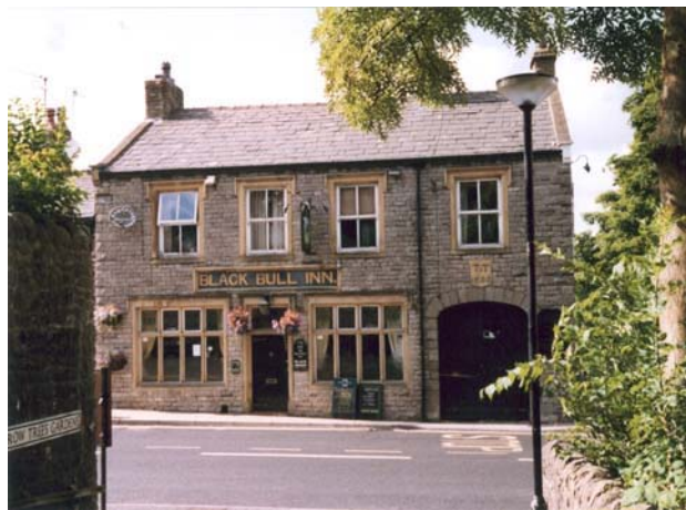
The Black Bull Inn, built in 1855

Although 20 th -century housing development has impinged to the northwest and east of the village, it is largely invisible from the centre of the village, being screened by older buildings or set on lower ground that falls away to the banks of the River Ribble.