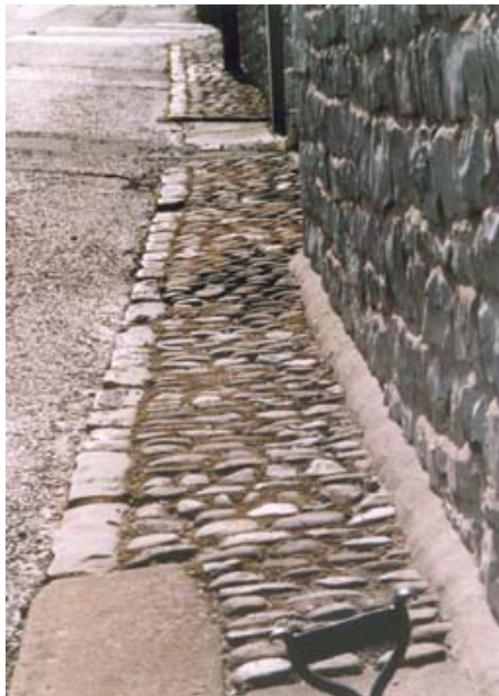
Historic paving in beside No. 1 Ribble Lane

The old toll house has made and sold Hudsons Ice Cream since 1947 and is well known in the area. A forge specialising in wrought iron (everything from beds and fire surrounds to gates and railings) and a second-hand car showroom are located opposite the school, along with a beautician and an estate agent specialising in overseas property. The school itself provides primary education, and has a village library and institute (for evening classes) attached. There is a police station and a funeral director in Downham Road.