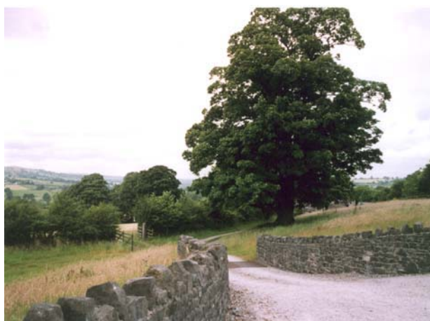
Boundary walls, trees and open paddocks at Town Head Barn, at the eastern end of the conservation area

The historic buildings of Chatburn are relatively modest and conservative, but are attractive because of the homogeneity of the stone walls and roofs all built from local stone with boundary walls of the same material. Most are built of light-grey carboniferous limestone (coursed and random, and where coursed usually rusticated), under roofs of dark brown carboniferous sandstone 'flags', but some later houses are of sandstone, which varies in colour from creamy yellow to pink. Roughcast render has long been used in the area as a wall covering, but most examples in Chatburn are now cement based or of pink-hued pebble dash (there are numerous examples in Downham Road and Wood Terrace).