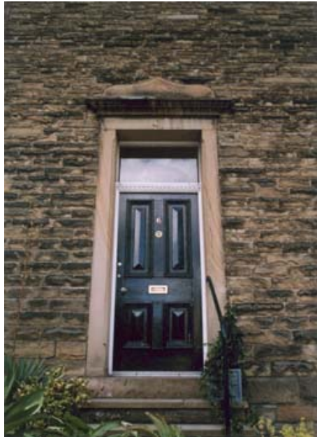
Original panelled door, Crow Trees Brow