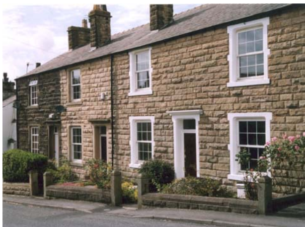
PVCu replacement windows in Downham Road

Some have more ornate but not elaborate door and window frames: Nos 8 to 16 Downham Road and the terraces either side of Chatburn Old Road have chamfered flat-arched lintels to the doors and windows with a drip mould above the doors. The Post Office and the houses on the eastern side of Ribble Lane have tall narrow arched doors with keystones and fanlights (it is worth noting that the panelled door and fanlight at the Post Office and the neighbouring house are recent insertions to a building that suffered extensive damage during World War II).