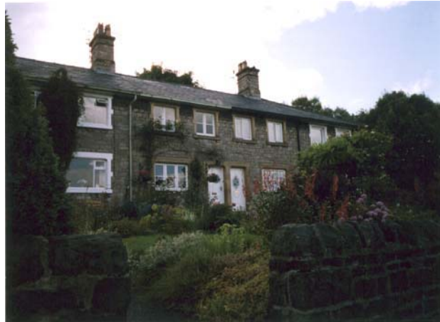
Mill workers' cottages at Nos 3 to 13 Ribble Lane

An area that has long been quarried for its limestone and an extensive quarry and cement works lies to the west of the settlement, though well screened by a belt of trees. Apart from this industrial activity, the village is essentially pastoral, with small sheep and dairy farms encircling Chatburn and forming the focal point of views out of the village to the upland slopes to north and south. The railway line and A59 trunk road to the east of the village are both set in deep cuttings, enabling the village to retain a sense of rural tranquillity.