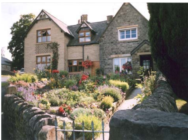
Replacement windows, Crow Trees Brow

Trees again screen the railway cutting south of Crow Trees Farm. They form an important component of the private road called Clough Bank, growing along the brook and in several large gardens.