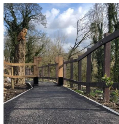
Primrose Lodge, Clitheroe.

3.13 Key statement EN3 of the Adopted Core Strategy sets out that new development in vulnerable areas should ensure that risks can be managed through suitable measures, including through the conservation of biodiversity, improvement of ecological networks and the provision of green infrastructure. The Council’s commitment to conserving and enhancing the area’s biodiversity and geodiversity is reiterated on Key Statement EN4. Where appropriate off-site commuted sums will be secured to enhance biodiversity within the Borough.