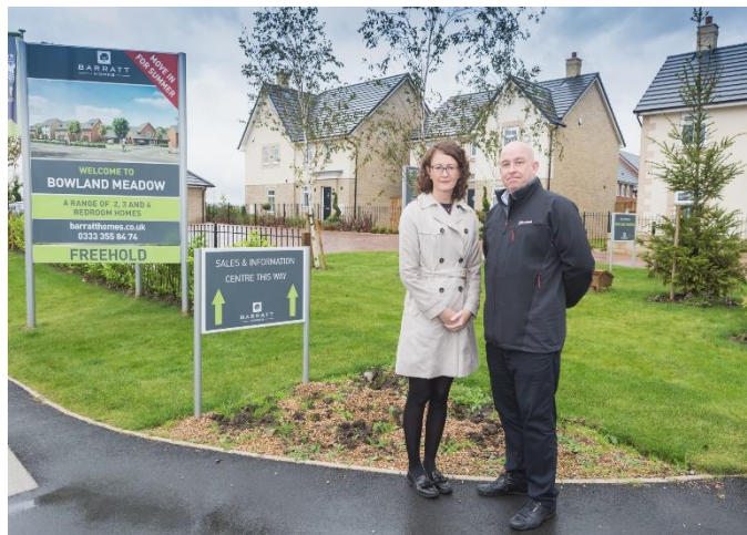
37 Affordable properties have been secured as part of development at Bowland Meadow, Longridge.