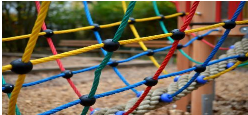
Holme Play Area, Sabden – Supported by S106 contributions.

3.11 The off-site contribution will be used to improve existing facilities within the Borough or to support the provision of new facilities for the benefits of our residents and visitors.